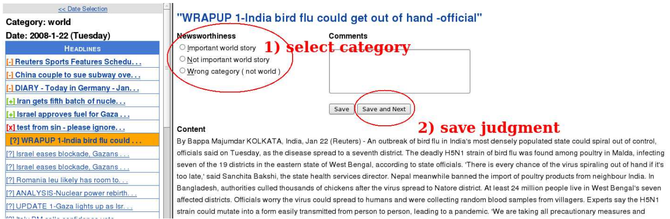
Figure 1: A screenshot of the external judging interface shown to workers within the instructions.

line and article content of the news story. According to best practices in crowdsourcing, we had three individual workers perform each HIT [12]. From these three judgments we take the majority vote for each story to create the label. The entire task totals 24,000 story judgments spread over 750 HIT instances. We paid our workers $0.50 (US dollars) per HIT (32 judgments), totalling $412.50 (including Amazon’s 10% fees).